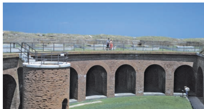
Fort Massachusetts on Ship Island