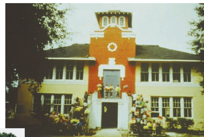
Lynn Meadows Discover Center